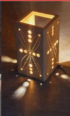
Product Design and Digital Technologies