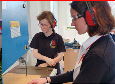
Textiles Technology Food Technology